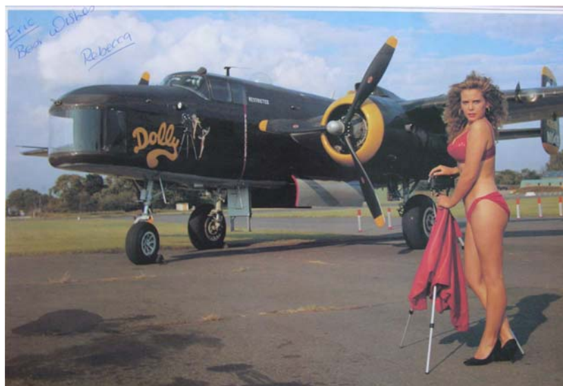
Our B-25 (almost) ready for delivery ?